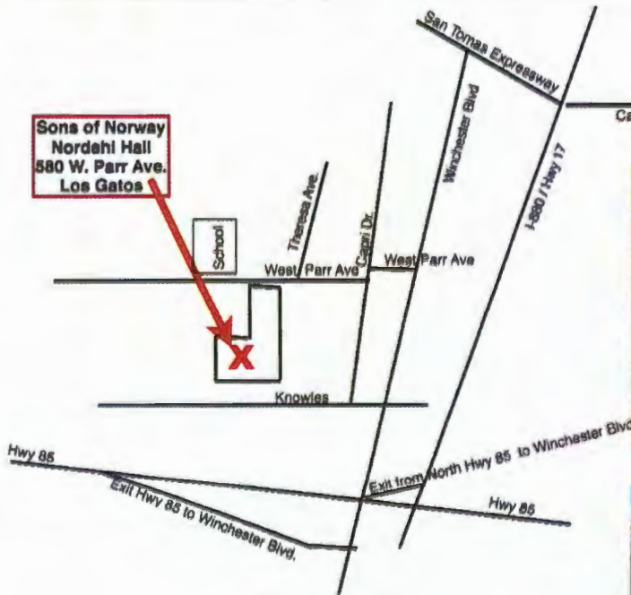
Map is not to scale