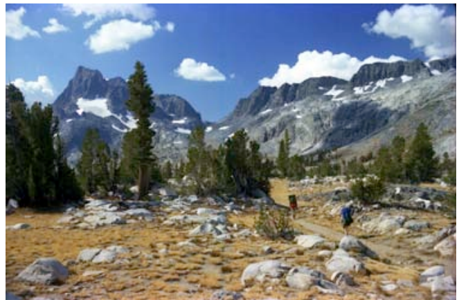
Minarets along the way on our most scenic pack trip from Tuolumne Meadows to Devil's Post Pile (approx 40 miles) 1981.