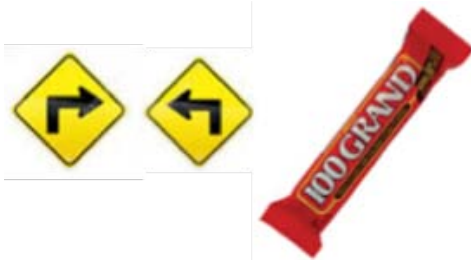
Photo Puzzle Time...

Where is the wettest spot on Earth? (And it's not the Amazon.)